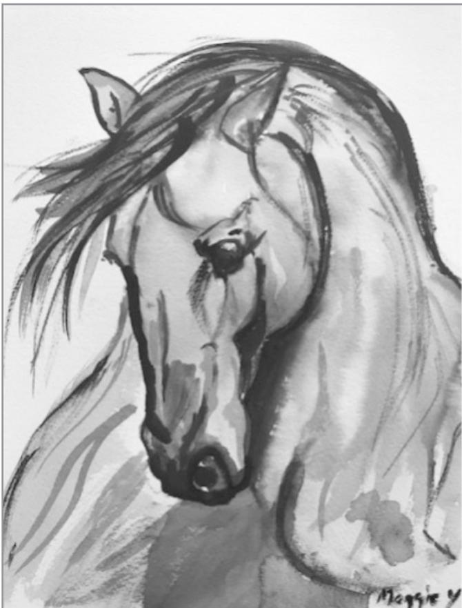
Drawing/painting by Maggie

If you're interested in joining us your first session is free and, if you decide to continue and become a member, it will be £3 a session when you're able to come.